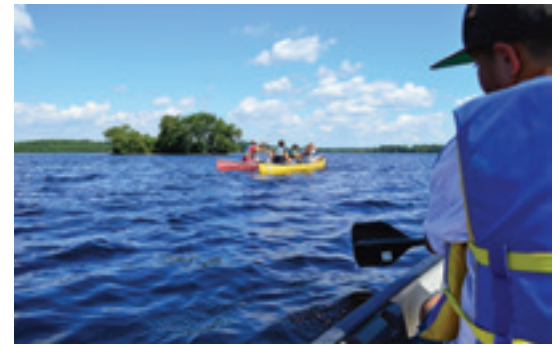
Campers in the Coalition's River Exploration Camp paddle across Snipatuit Pond in Rochester.