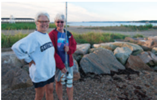
Baywatcher Volunteers enjoy a beautiful morning while water sampling at Clarks Cove, New Bedford.