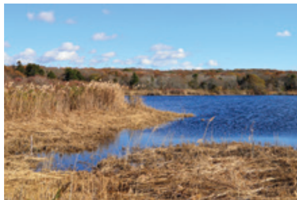
Flume Pond is becoming visible again where invasive Phragmites australis were removed in year one of a three-year Coalition restoration project in partnership with the 300 Committee - Falmouth's Land Trust.