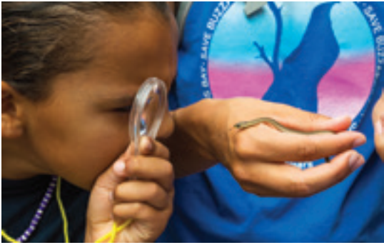
Coalition campers discover wildlife that is living in the forests of Nasketucket Bay State Reservation.